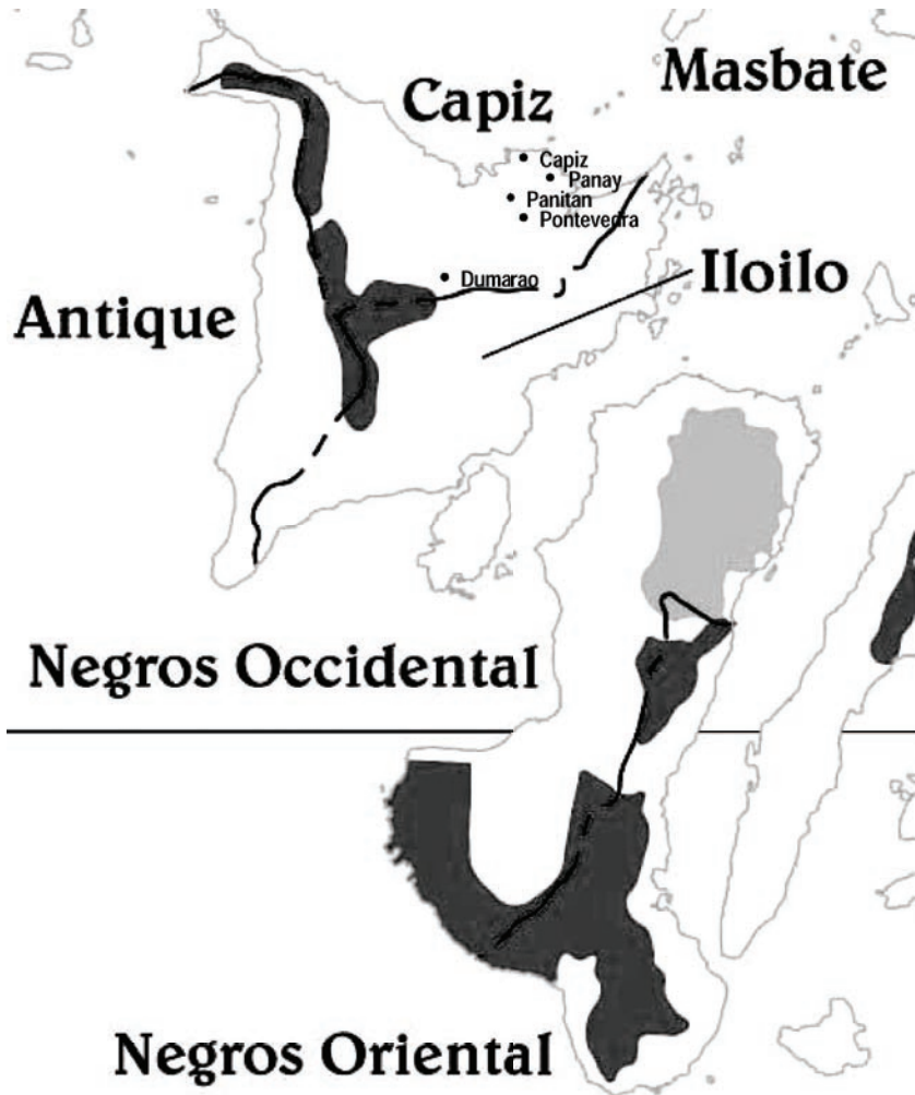
Map 2. Western Visayas showing the remaining forests (shaded areas), c.1900