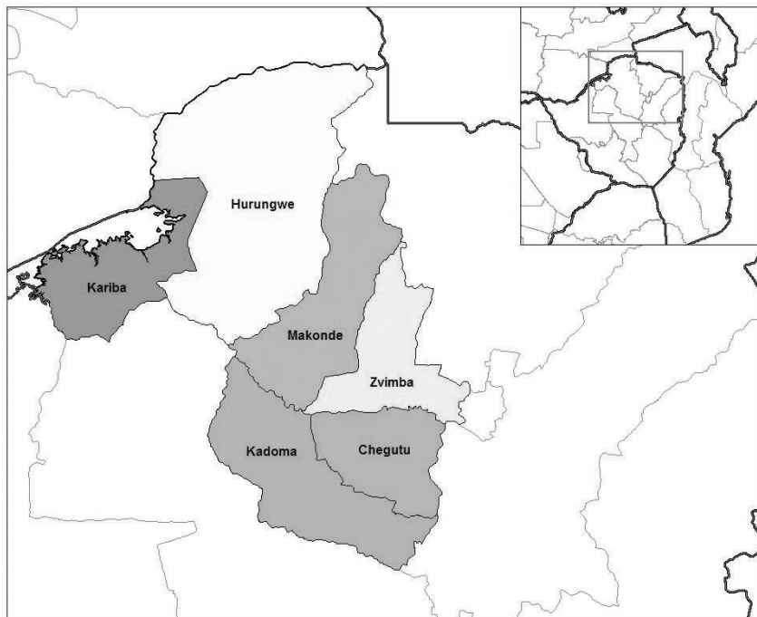
Figure 2. Mashonaland West Region: area 57,441 km 2 , population 1.2 million (2002). Chinhoyi is the capital of the region

down trees to an extent not witnessed before in order to clear land for cash and food crop production. According to Tanzikwa Guranungo, urban dwellers retrenched from their jobs in Harare, Chinhoyi and Chegutu have increased the numbers of these farmers, putting further pressure on woodland. The urban unemployed also migrated from the cities to rural areas in the 2000s in search of alternative sources of livelihood. According to Mutizwa Munyimi, a village head in the Makonde District: “Many people have returned home following retrenchment and are cutting down trees to clear land for cultivation and for various domestic purposes like building